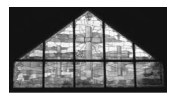
FIRST CHRISTIAN CHURCH (Disciples of Christ) 313 Chloe Road Pikeville, KY 41501