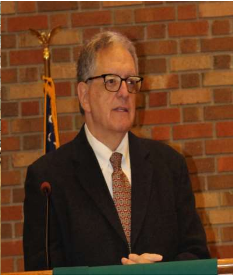
Laity Sunday 2023