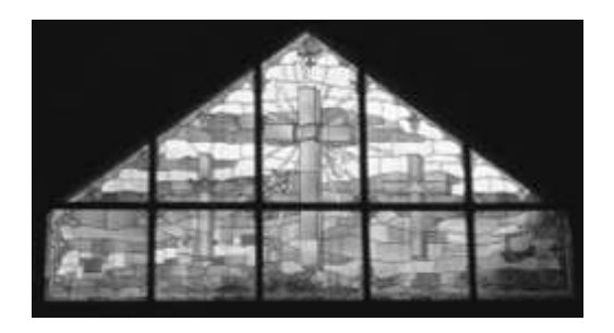
FIRST CHRISTIAN CHURCH (Disciples of Christ) 313 Chloe Road Pikeville, KY 41501